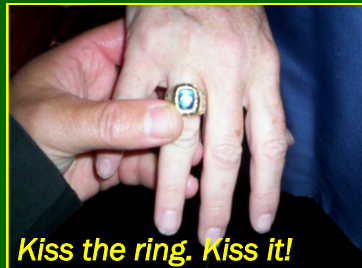
Kiss the ring. Kiss it!