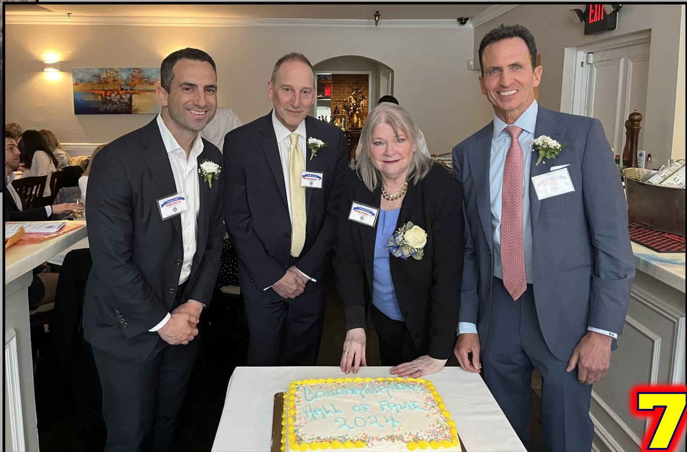
Below and below left: profiles of the cake, soon to be drawn and quartered. RIP, cake. You gave so much pleasure to so many during your brief time on this earth.